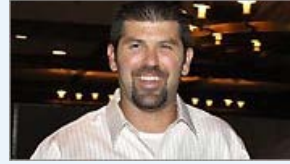
Sox catcher Jason Varitek at a Boston fund-raiser, and more

Fish for Halibut, Salmon & Ling Cod on the Homer spit since 1979 www.bobstrophycharters.com