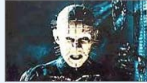
In time for Halloween, the 50 scariest movies of all time